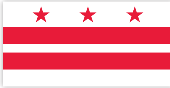
DISTRICT OF COLUMBIA FLAG